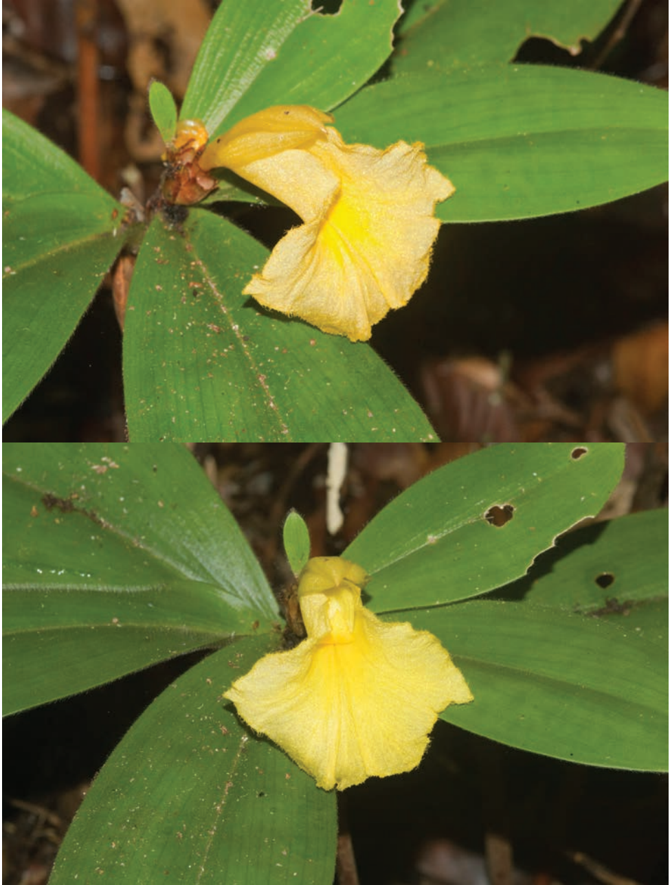
Figure 1. Photographs of Costus loangensis from the single known population.

a dense indument of erect to half-appressed hairs. Costus loangensis differs from Costus spectabilis (Fenzl) K.Schum., another short-stemmed yellow-flowered species, by having a well developed aerial stem. Costus spectabilis inhabits savannas and has only 4