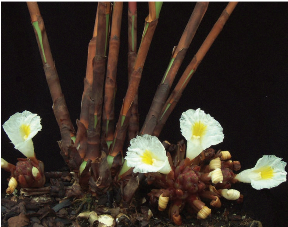
Figure 1. Cheilocostus borneensis ( Poulsen 2696 , cultivated).

Cheilocostus borneensis in inflorescentia radicali C. globoso similis est sed ab eo foliis ad apicem caulis aggregatis plerumque majoribus et calyce molliter acuto (haud pungenti nec aculeato) differt. – Typus: Malaysia, Borneo, Sarawak, Batang Ai, Sungai Senkabang, small stream connecting to Sg. Delok opposite of Ng. Sumpa longhouse, 1°12'S 112°3'E, 130 m, flowering 8 Dec 2002, A.D. Poulsen & Bakir Raymond 1964 (holo, SAR; iso, AAU, Sarawak Biodiversity Centre Flora Depository). Figs. 1 & 2.